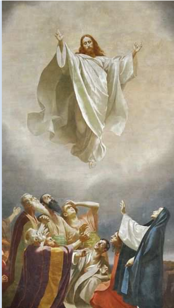
Christi Himmelfahrt by Gebhard Fugel, c. 1893