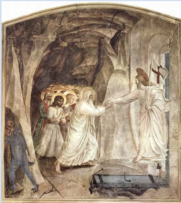
Christ in Limbo , by Fra Angelico, 1441

The blessing of the eternal, triune God— Alpha and Omega, first and last, beginning and end— be with you all. Alleluia! (Revelation 22:13)