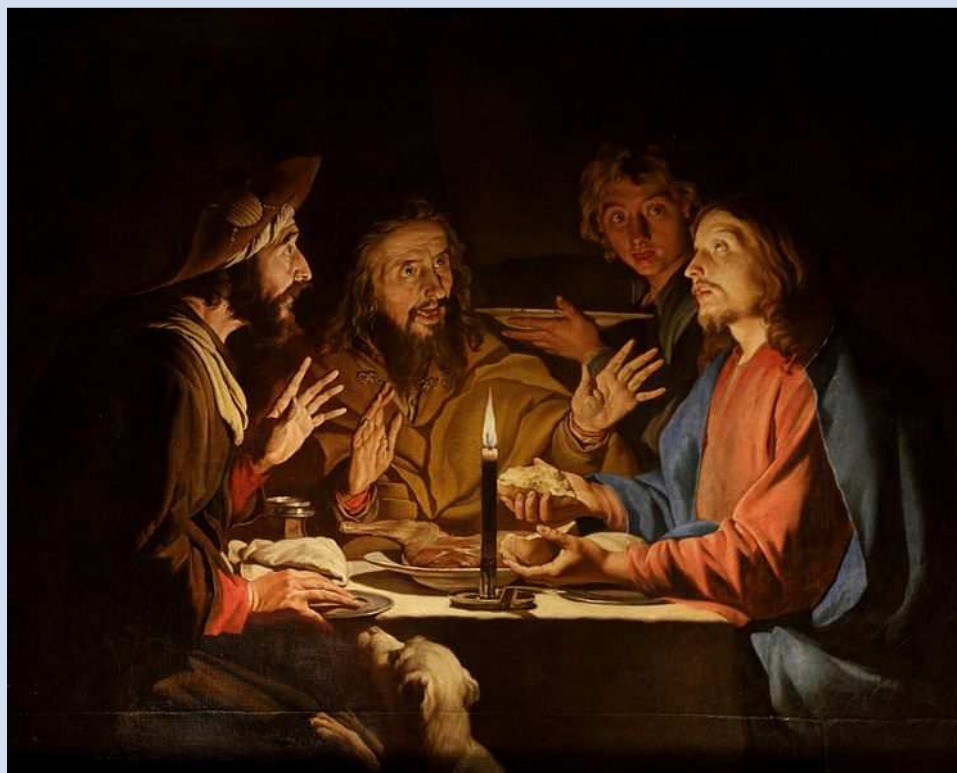
Supper at Emmaus , by Matthias Stom (17 th century)

The blessing of the eternal, triune God— Alpha and Omega, first and last, beginning and end— be with you all. Alleluia! (Revelation 22:13)